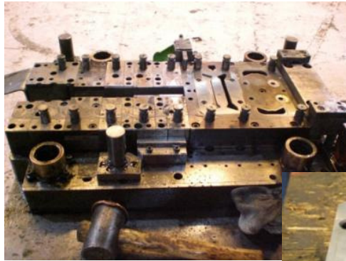
TOOLOX 44, nitrided Blanking of 3.8 mm 270 MPa sheet